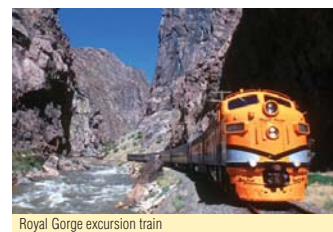
Royal Gorge excursion train

Day 12 Today's 260 mile drive will take you through some amazing scenery including the San Juan scenic byway through the National Forest, where Mount Wilson rises 14,246 feet to your left. Drive on to Montrose, where you turn and head east along the Gunnison River. Watch out for the Black Canyon of the Gunnison National Monument to your left and see the sheer rock walls plummet some 2500 feet to the River. Shortly you will cross the Blue Mesa Reservoir to reach the Gunnison KOA – home for tonight. Arriving just after 2pm, any way you turn from this campground leads toward spectacular scenery.